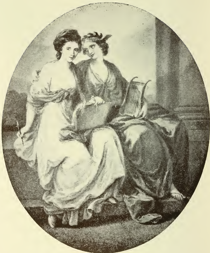
Angelica Kauffman, pinxt